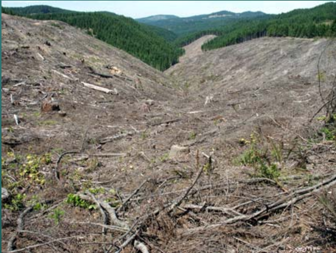
SFI certified forest, Washington