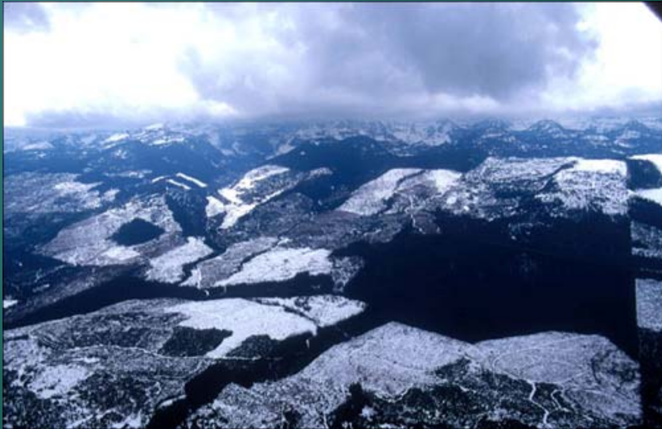
SFI certified forest, Montana