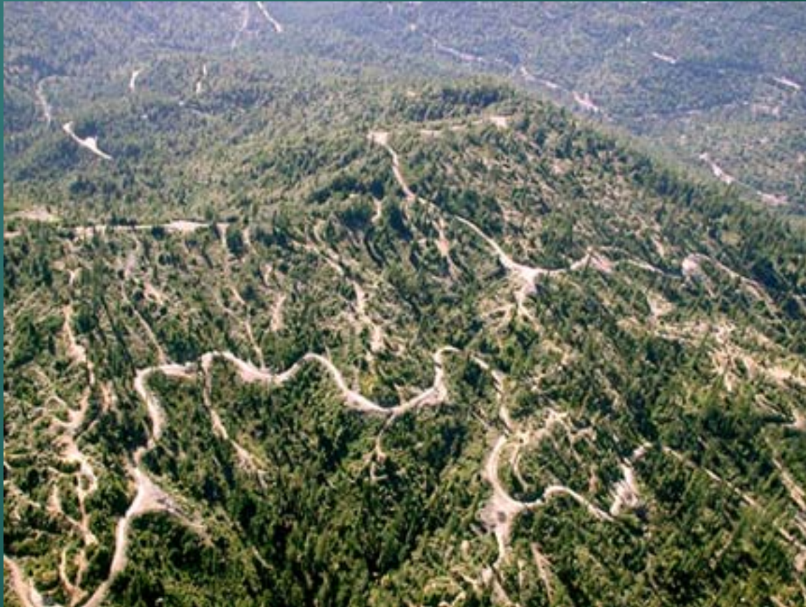
SFI certified forest, California