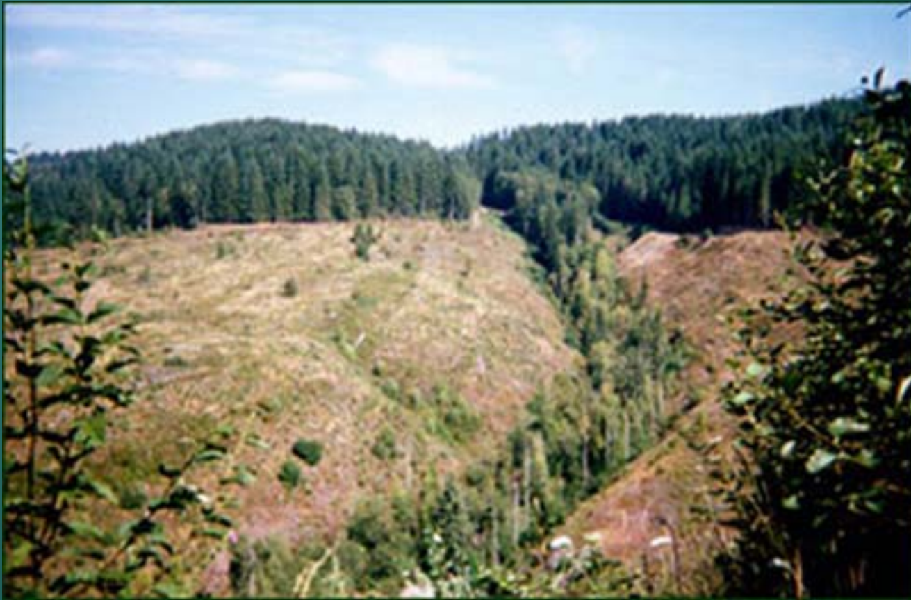
SFI certified forest, Oregon